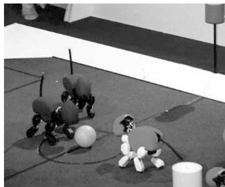
Figure 2: A scene from Sony legged robot demonstration

In RoboCup-98, Sony Legged Robot exhibition games and demonstration were held, and they attracted many spectators, especially boys and girls, for its cute style and behaviors. Figure 2 shows a scene from their demonstrations. In 1999, Sony Legged Robot league will be one of the RoboCup official competitions with more nine teams around the world.