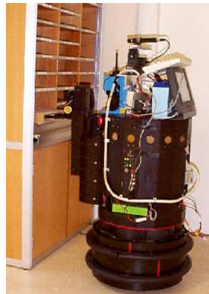
Figure 4: Mail Delivery by a Service Robot

Service robots are gradually moving into the domestic market. The applications will here involve more complex tasks like cleaning of a table, locating objects, and assisting humans. One example of such a system is the intelligent service robot developed at the Royal Institute of Technology [Andersson et al. , 1999]. For operation in a natural environment it is necessary to use navigation techniques like the probabilistic mapping mentioned earlier, as robustness is an absolute requirement. To achieve robustness the robot uses vision, laser and ultra-sonic ranging. The system uses a hybrid deliberative architecture [Arkin, 1998] with dedicated behaviours for exploration, door traversal, user-interaction, object recognition, point-to-point based navigation. The system uses a topology graph for planning of missions which in turn are expected by combinations of behaviours. The system is presently capable of delivering mail to a range of different researchers in the laboratory and operation in a natural IKEA style living room. The robot is shown in Figure 4. In addition to robust navigation the system