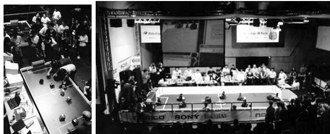
(a) the small size (b) the middle size